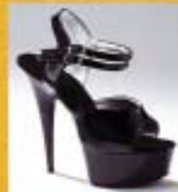
DOUBLE ANKLE-STRAP SHOE WITH 6" HEEL AND 2" PLATFORM. £39.99