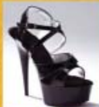
CROSSOVER STRAP MULE WITH 6" HEEL ON 2" PLATFORM. £39.99

see the full range of STILETTO SHOES at www.doreenfashions.com or visit the shop and try them on in person at 644 Lea Bridge Road Leyton E10 6AP Tel: 0208 539 4578