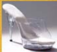
OPEN-TOE MULE WITH 5" HEEL & 1&1/4" PLATFORM. £34.99