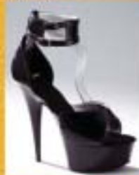
'FETISH' DOUBLE-STRAP, 6" HEEL, 2" PLATFORM SHOE. £39.99