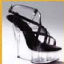
LATTICE STRAP 6" HEEL MULE ON CLEAR PERPEX PLATFORM. £39.99