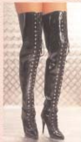
Lace-front Thigh Boots £59.99