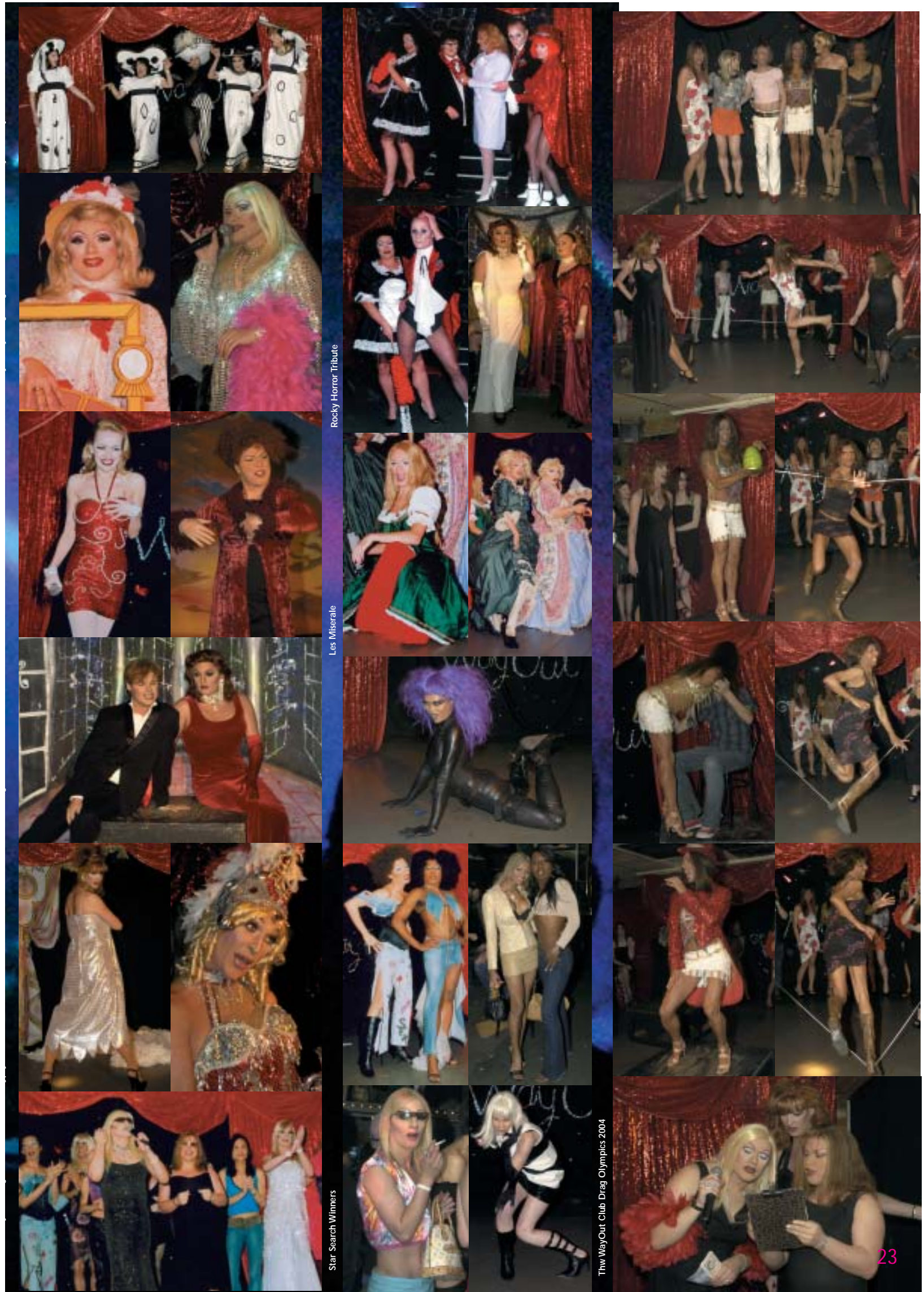
Rocky Horror Tribute