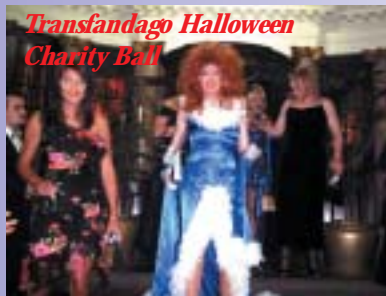
Transfandango Halloween Charity Ball

October 30th 2004 - Transfandango Halloween Charity Ball held at the London Marriott Hotel, Grosvenor Square/Duke Street, London W1 tel charity office for tickets 0161 737 1203 www.transfandango.co.uk