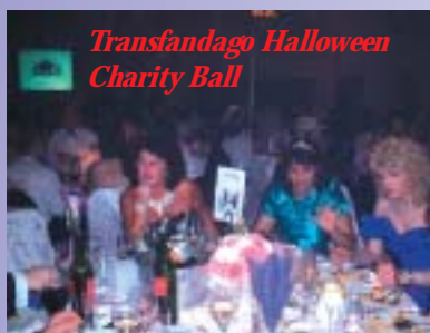
Transfandango Halloween Charity Ball